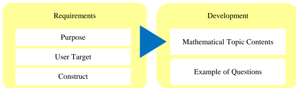
Fig 1: Development of problem-solving tests flowchart

Before and after studying Integral Calculus, the experimental and control groups collected quantitative data through problem-solving assessments. Problem-solving tests were divided into two categories: pre-test and post-test. A pre-test was given to the students before they were taught Integral Calculus, and a post-test was given at the end of the intervention. Fig. 1 depicts the requirements study and development phases of building the problem-solving tool.