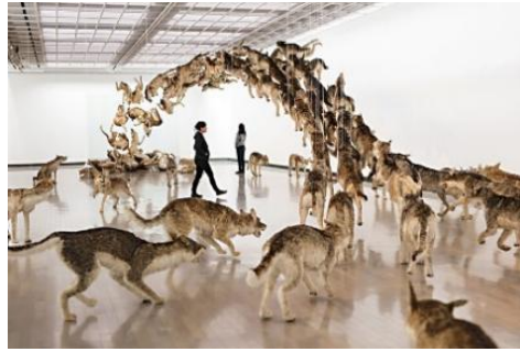
Fig. 4: Head on, 2006

This artwork centers around animals as its key elements. Artist Cai Guoqiang's installation piece "Head On" consists of 99 life-sized wolf models crafted from stitched sheepskins and filled with straw and metal wire. These wolves continuously tumble through the air, relentlessly charging toward a glass wall in an endless cycle. The synchronized wolves collide forcefully with the empty wall, causing some to rebound onto the ground injured or dead, their arcs upon impact leaving viewers breathless. The wolves leap and collide with the glass wall repeatedly, creating a perpetual loop that showcases a powerful visual impact. Created in 2006, this piece premiered at the Deutsche Guggenheim Museum in Berlin (Wockenfuss, 2011).