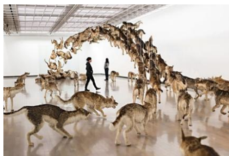
Fig. 4: Head on, 2006

The installation in the picture presents a striking scene composed of 99 life-sized wolf sculptures and a glass wall, creating a dynamic installation. In the exhibition space, the arrangement of the sculptures and the glass wall highlights the interaction between the wolves and the barrier. The wolves are made with realistic fur, while the glass wall has a transparent and reflective surface. This combination of materials creates a contrast between the solidity of the wolves and the transparency of the glass, enhancing the visual effect of the installation. The color tones are mainly warm, similar to the color of the wolves' fur, and lighting is used to illuminate the space and highlight the installation, creating shadows and reflections that add to the overall atmosphere. The wolves are constantly jumping and colliding with the glass wall, forming an arch-like bridge, with the work presenting repetitive and cyclical motion. The repetitive movement of the wolves creates a sense of tension and urgency, conveying the concept of eternal struggle and conflict.