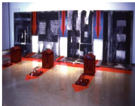
Fig. 5: Three and three others, 1988

In the exhibition space depicted in the picture, three cages stand out, evenly spaced on the ground, with red arrows marked on the floor. The cages use a Greek temple-like structure and are dark red in color. In front of each cage, there are mousetraps and poisonous food. The overall lighting of the work is dim, with light focused on key parts to enhance the sense of scrutiny. While the installation appears static on the surface, the environment conveys a sense of tension and discomfort.