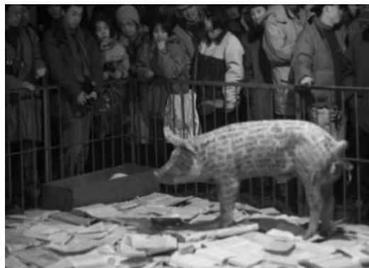
Fig. 3: A case study of transference, 1994

The installation in the picture presents a corner of a pigsty made of a mix of wood and metal materials, displaying a rustic and primitive texture. A pig stands inside, with many fabricated texts on its back and its feet trampling on a pile of Chinese and English books. The pigsty is surrounded by a crowd of onlookers. The audience can visually perceive the overall layout of the work and the pig's activities, and they can also feel the presence of the books by touching them. The colors in the work mainly consist of the natural hues of wood and metal, as well as the inherent colors of the books, without any particularly striking lighting effects.