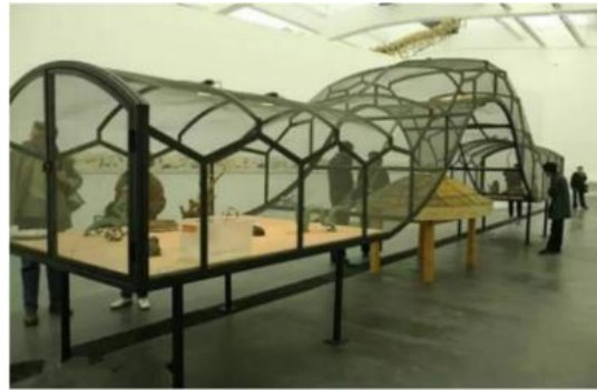
Fig. 2: Theater of The World, 1993

From a formal analysis of the work of art, "Theater of the World" employs various visual elements and design principles. The arched cage occupies a significant space, creating an enclosed and tense environment. The metal cage exudes a cold and oppressive feeling, whereas the live insects and reptiles add dynamism and realism to the piece. In terms of color, the cage uses cool tones that contrast with the natural colors of the animals, further enhancing the visual impact. The overall structural design provides the audience with a comprehensive view, allowing them to observe and reflect from various angles (Kleutghen, 2016).