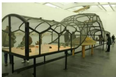
Fig. 2: Theater of The World, 1993

Huang Yongping's installation artwork "World Theater," created in 1993, is a highly controversial piece. The work is arched, resembling a moving snake and, at the same time, a bridge. Inside this "snake," there are real and fabricated animal images, including five real turtles and ten real snakes, as well as replicas of auspicious Qing Dynasty bronzes, dragons, Xuanwu, and toads borrowed from Chinese collections in Paris. Below the snake, in the "turtle table," there are multiple drawers containing hundreds of insects and reptiles devouring each other, reminiscent of the gladiatorial arenas of ancient Rome. After the exhibition opened, these animals were confined in cages, fighting inside while the audience observed the entire process from outside. This artwork debuted at the Pompidou Center in Paris at the end of 1994 but was eventually withdrawn due to protests from animal rights activists (Pan, 2020).