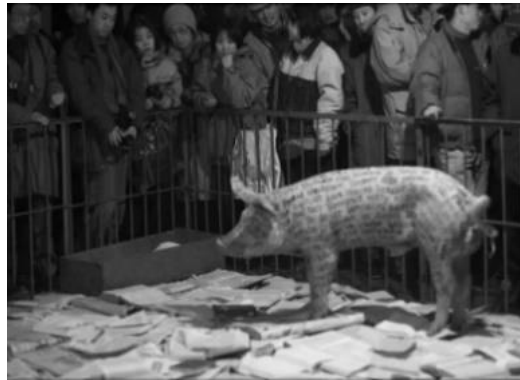
Fig. 3: A case study of transference, 1994

The installation in the picture presents a corner of a pigsty made of a mix of wood and metal materials, displaying a rustic and primitive texture. A pig stands inside, with many fabricated texts on its back and its feet trampling on a pile of Chinese and English books. The pigsty is surrounded by a crowd of onlookers. The audience can visually perceive the overall layout of the work and the pig's activities, and they can also feel the presence of the books by touching them. The colors in the work mainly consist of the natural hues of wood and metal, as well as the inherent colors of the books, without any particularly striking lighting effects.