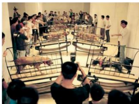
Fig. 6: The dog you can't touch, 2003

The exhibition space in the picture features eight non-motorized treadmills, with eight pit bulls arranged in two rows, standing on the treadmills. The two rows of dogs are positioned face-to-face, separated by the treadmills and partitions. The overall color scheme is simple, primarily in warm tones, highlighting the pit bulls and the treadmills. In the picture, the dogs can be seen continuously running on the treadmills, but their movement is restricted by the treadmills, emphasizing the futility of their efforts. It can be imagined that the audience can see the dogs' movements and the space is filled with the sounds of the dogs panting and the treadmills, further increasing the sense of tension.