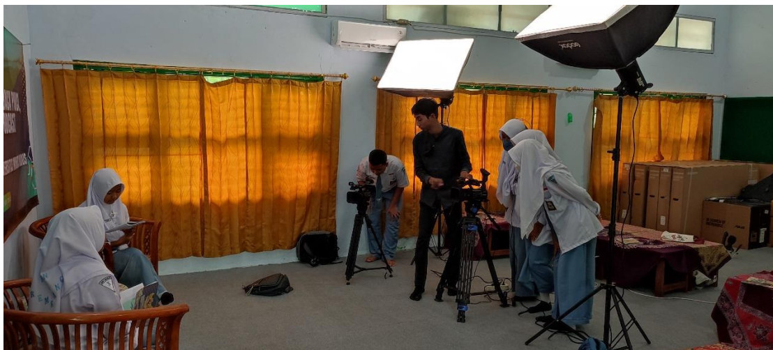
Figure 1: Podcast practice

Addressing these three key issues will provide a strong foundation for successful training and effective use of podcasts in education at SMK Al Mubaarok Rembang. Once these issues are addressed, focus can shift to medium priority issues such as the provision of learning resources, overcoming resistance to new technologies, and timing for training and practice.