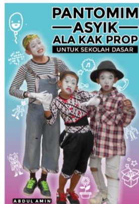
Figure 3: Book cover