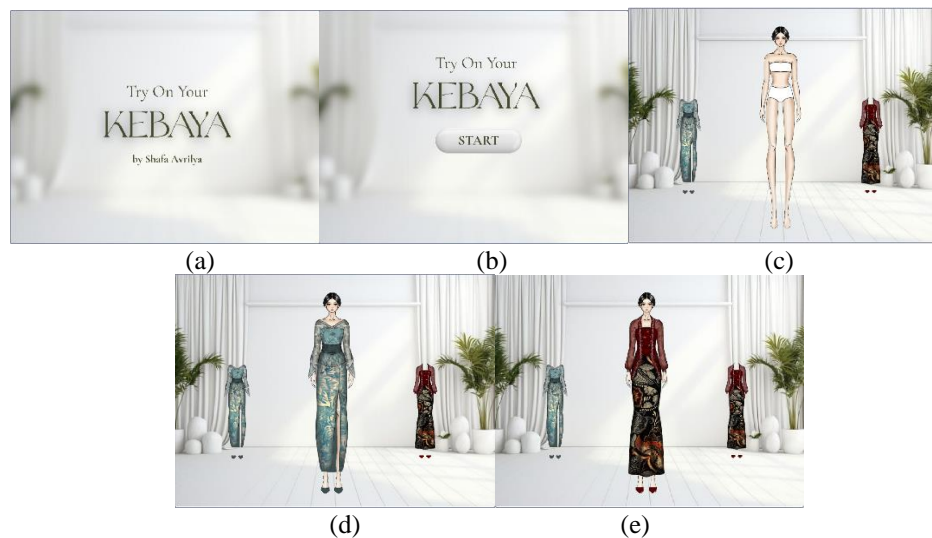
Figure 1: (a) First Display; (b) Main Menu; (c) Selection Phase; (d) Preview Kebaya 1 (Green); (e) Preview Kebaya 2 (Red)

Finally, the images in the bottom row, though not explicitly labeled with a letter, represent the "Try-On" or "Preview" phases. The image on the left, which we can designate as Phase (d), showcases the Try-On / Preview of Kebaya 1. Here, the virtual model is depicted already adorned in the green kebaya. This visual outcome is a direct result of the try-on process, allowing the user to clearly visualize how the chosen kebaya appears on the model. This perspective is vital for users to evaluate the kebaya's aesthetics. Similarly, the image on the right, Phase (e), illustrates the Try-On / Preview of Kebaya 2.