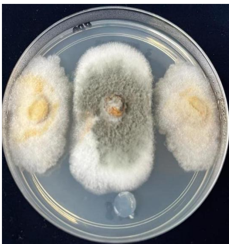
Fig. 2: Dual culture antagonistic between Trichoderma spp. and Colletotrichum gleosporioides

Trt: Radial growth of Colletotrichum gleosporioides with Trichoderma spp.(mm)